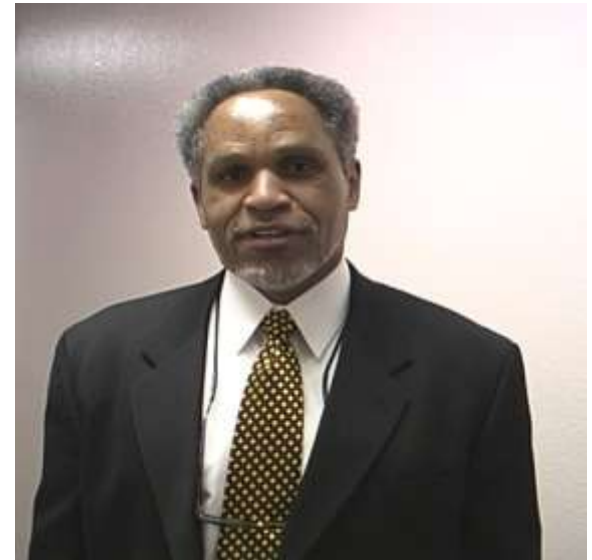
Mayor John Street (1/3/00 – 1/7/08)